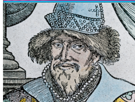
Ivan III 1440–1505

Those around him often viewed Ivan as cold, calculating, and ruthless. This may have been due in part to a difficult upbringing. Ivan came of age during a time of great civil strife in Russia. His father, Grand Prince Vasili II, was at one point imprisoned and blinded by opposition forces.